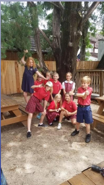
4 TH Grade Explores Downtown Churches and Cathedrals